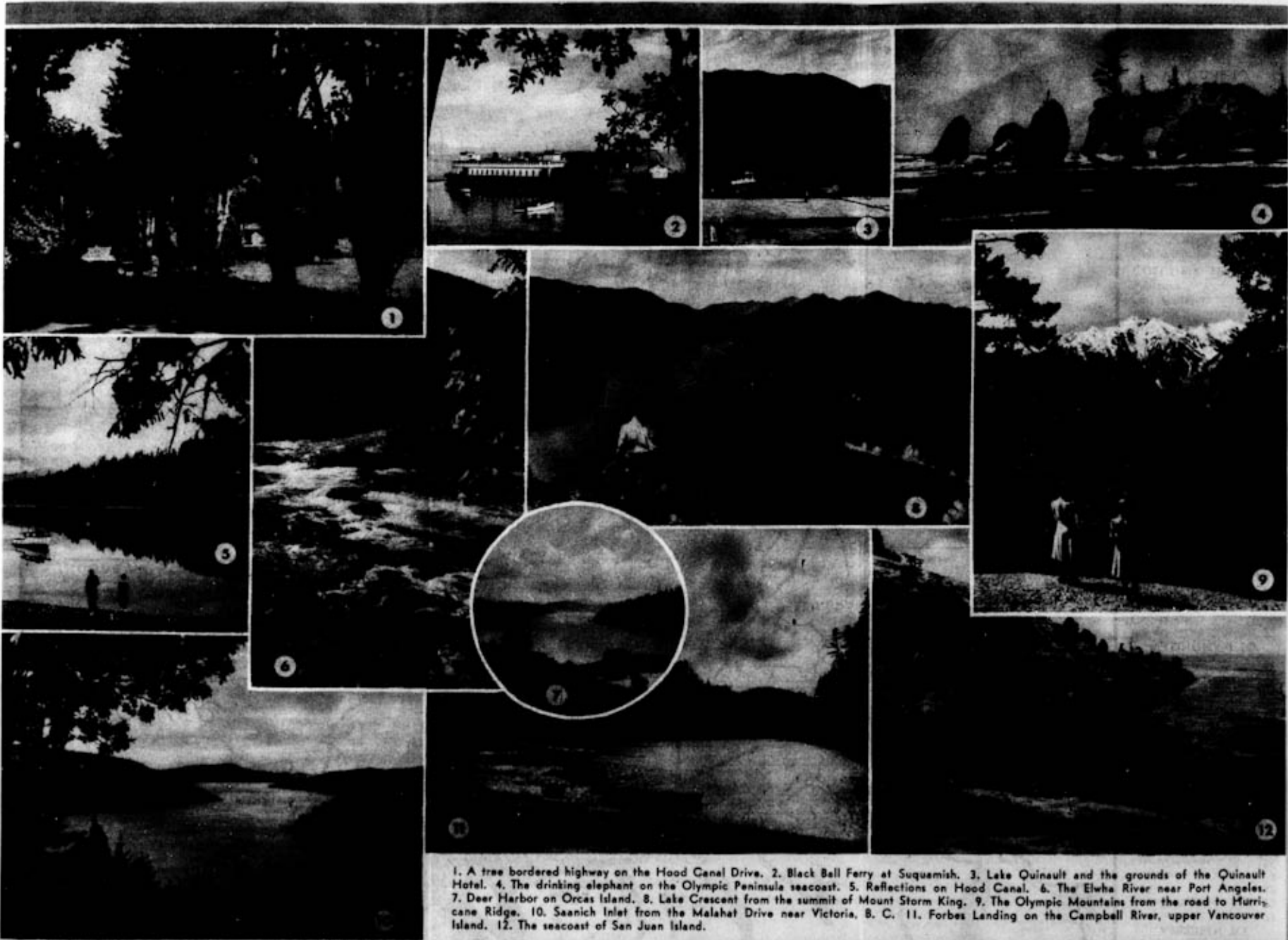
1. A tree bordered highway on the Hood Canal Drive. 2. Black Ball Ferry at Sequimish. 3. Lake Quinalt and the grounds of the Quinalt Hotel. 4. The drinking elephant on the Olympic Peninsula seacoast. 5. Reflections on Hood Canal. 6. The Elwha River near Port Angeles. 7. Deer Harbor on Orcas Island. 8. Lake Crescent from the summit of Mount Storm King. 9. The Olympic Mountains from the road to Hurricane Ridge. 10. Saanich Inlet from the Malahat Drive near Victoria, B. C. 11. Forbes Landing on the Campbell River, upper Vancouver Island. 12. The seacoast of San Juan Island.