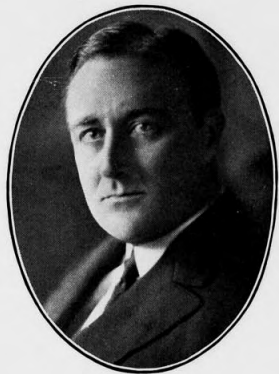
Our Honor Guest HON. FRANKLIN D. ROOSEVELT Governor New York State